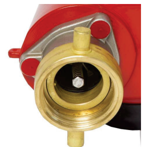
CFA / SAFB / QRT